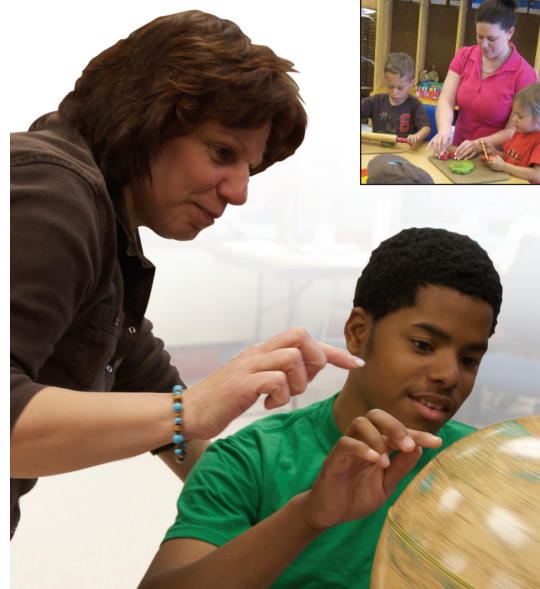
Educational Services That Transform Lives